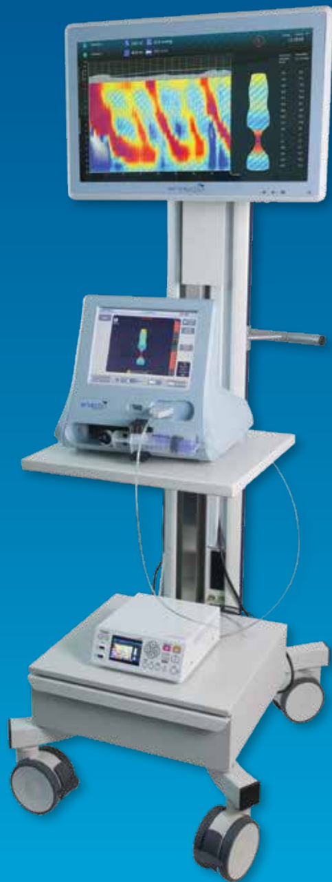
Endoflip™ impedance planimetry system